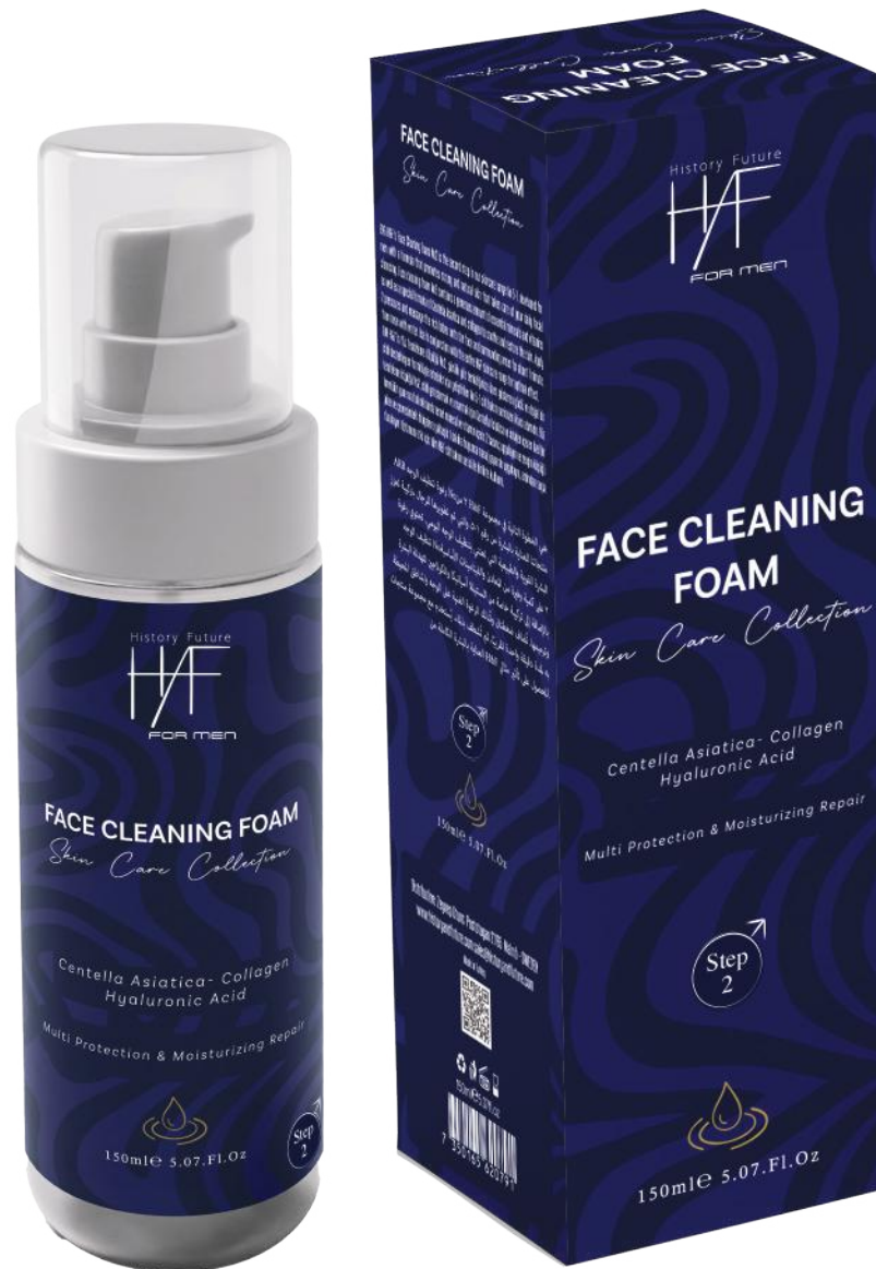
Face Cleaning Foam