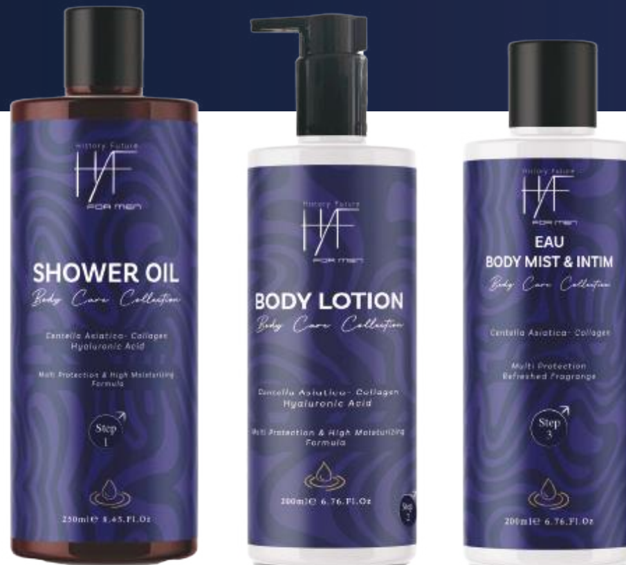
Eau De Mist & Intim Fragrance No 3